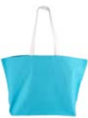
BLUE & WHITE GJCANV10BBBLUE

Dimensions: W: 55 x H: 36 x D: 16 (cm) W: 21.7 x H: 14.2 x D: 6.3 (inches)