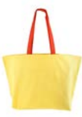
YELLOW & RED GJCANV10BBYELLOW

This stylish and practical bag is perfect for retail, offering an excellent way to advertise your brand or showcase your stylish artwork. As versatile and durable as our premium 10oz cotton canvas bag, these larger colourful bags provide extra storage space and a larger canvas for advertising.