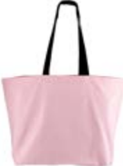
PINK & BLACK GJCANV10BBPINK